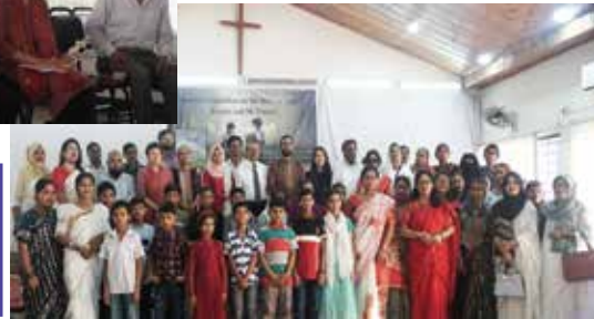
BDP School Children, Teachers and invited guests at the event