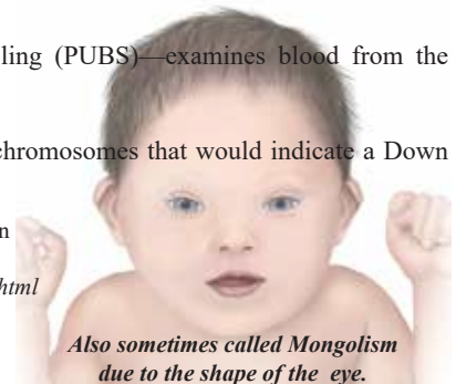
Also sometimes called Mongolism due to the shape of the eye.